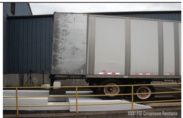
6000 PSF Compressive Resistance