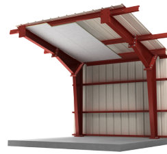
Engineered Metal Building Ceiling